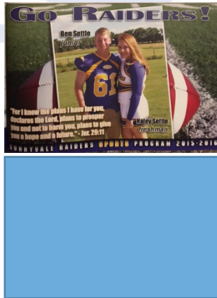
Half Page - $175 (7.75" w x 4.75" h)