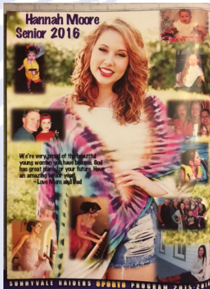
Full Page - $275 (7.75" w x 10"h)